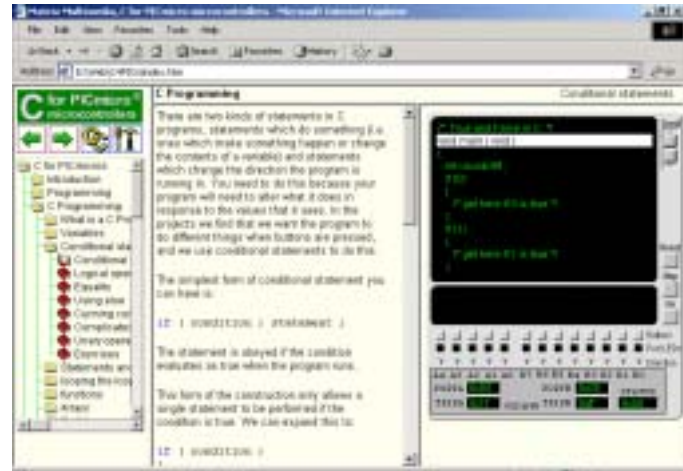
Screen image shows Virtual C PICmicro

Although the course focuses on the use of the PICmicro microcontrollers, this CD-ROM will provide a good grounding in C programming for any microcontroller. The C compiler on this product is not licensed for industrial use.