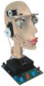
Alex animated head can be programmed from C for PICmicros using the Actuators training panel